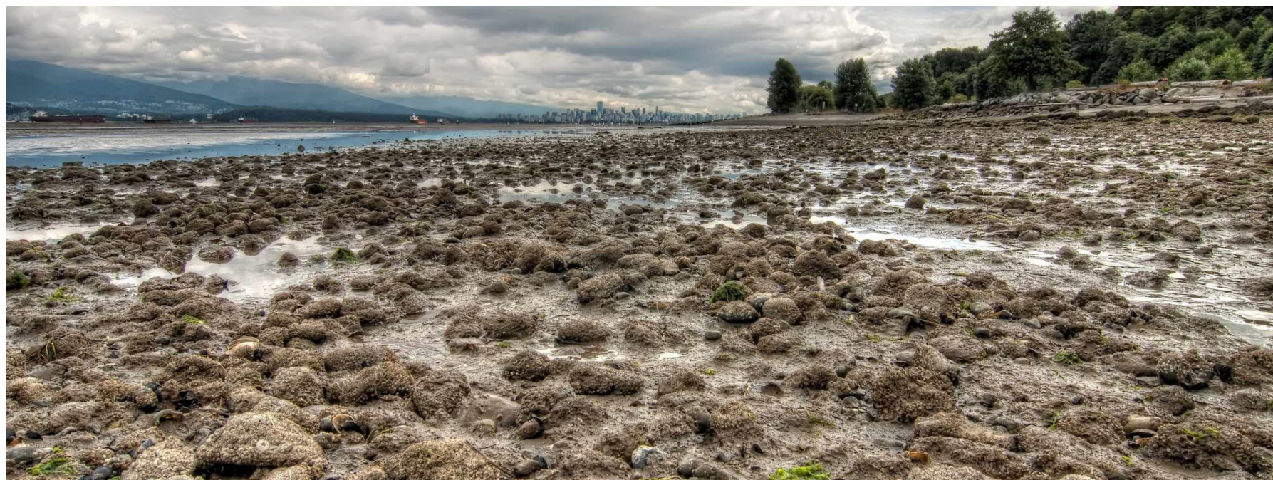
NW Marine Dr Vancouver

A vacation to Victoria doesn't have to involve basing yourself at one place – other hotels in the Greater Victoria area to note include Sookepoint Ocean Cottage Resort ( https://www.booking.com/hotel/ca/sookepoint-ocean-cottage-resort.html?aid=886730 ) in nearby Sooke, and Wild Renfrew ( https://www.booking.com/hotel/ca/wild-renfrew-seaside-cottages.html?aid=886730 ) two hours north in the quaint fishing village of Port Renfrew.